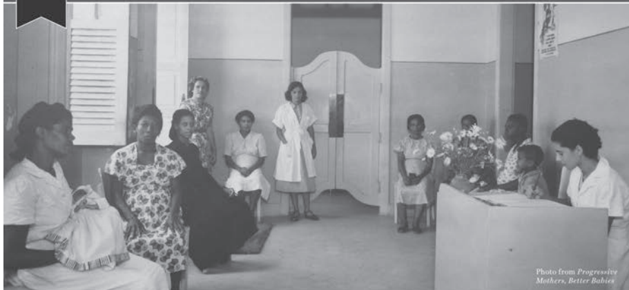
Photo from Progressive Mothers, Better Babies