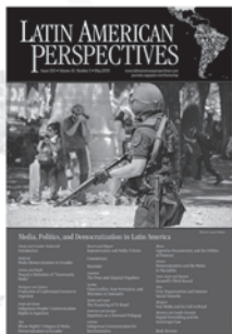
Media, Politics, and Democratization in Latin America