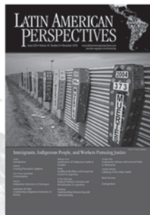
Immigrants, Indigenous People, and Workers Pursuing Justice

Latin American Perspectives is a multidisciplinary journal that welcomes a variety of theoretical and political perspectives to analyze capitalism, imperialism, and socialism in the Americas and strategies to transform the region's sociopolitical structures. Most issues focus on a single problem, nation, or region, providing an in-depth analysis from scholars and participants in social change.