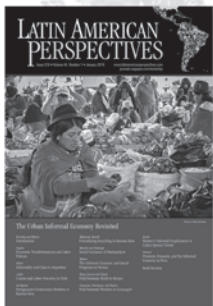
The Urban Informal Economy Revisited